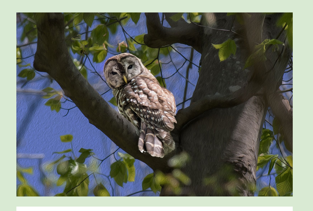
Did you see me get it?